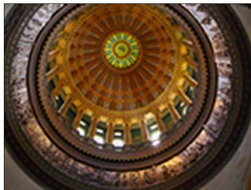
Gorgeous View of the Capitol Dome