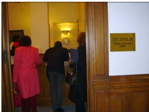
Senate President Emil Jones' Office