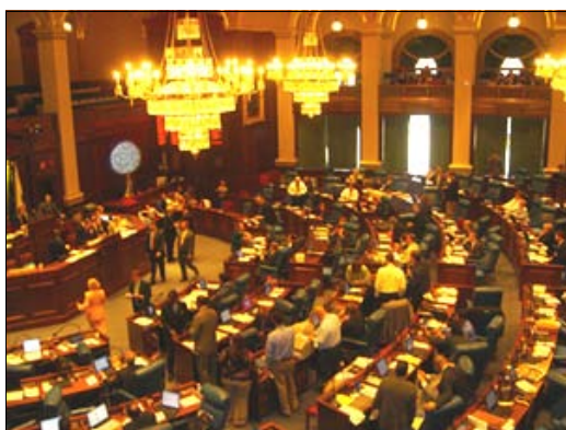
House Chambers (Cathy almost got arrested for taking this picture!)