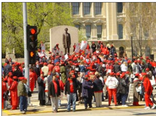
Rally on the steps on the Capitol with CTU